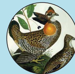
Heath Hen Extinct 1932