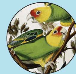
Carolina Parakeet Extinct 1918