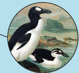
Great Auk Extinct 1844

You can find all five birds in the Smithsonian Gardens.